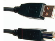
C21 USB Cable For PC or Mac