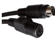
C41 6 pin mini-din PC Keyboard Y Cable

CAUTION LASER LIGHT RADIATION FROM THIS PRODUCT MAY BE HARMFUL TO YOUR EYES. DO NOT STARE INTO BEAM. CLASS II LASER PRODUCT. LASER RADIATION - HEAVY DUTY STRAIN RELIEF. RECLASS II LASER PRODUCT. PARALLEL APPARATUS A LASER OF CLASS II. WORTH DATA INC. - SANTA CRUZ, CA